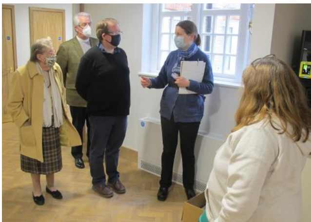
Touring the site