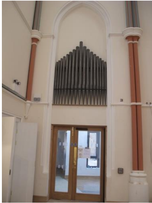
The organ pipes return