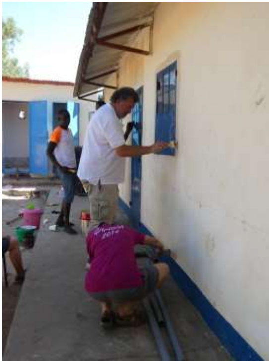
Painting the teachers' accommodation