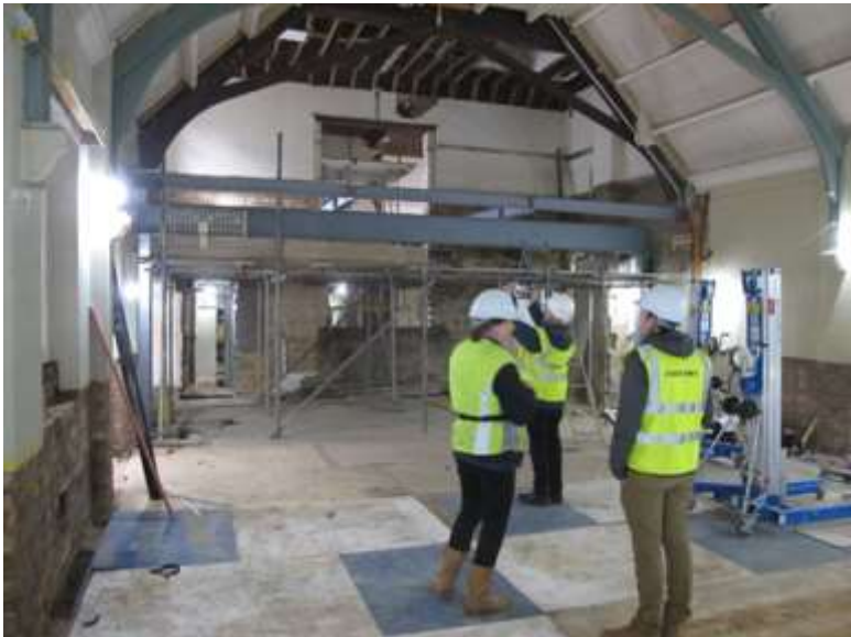
Gibson Hall - New steels in place