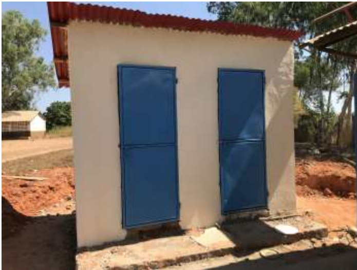
The new toilets at Jiroff