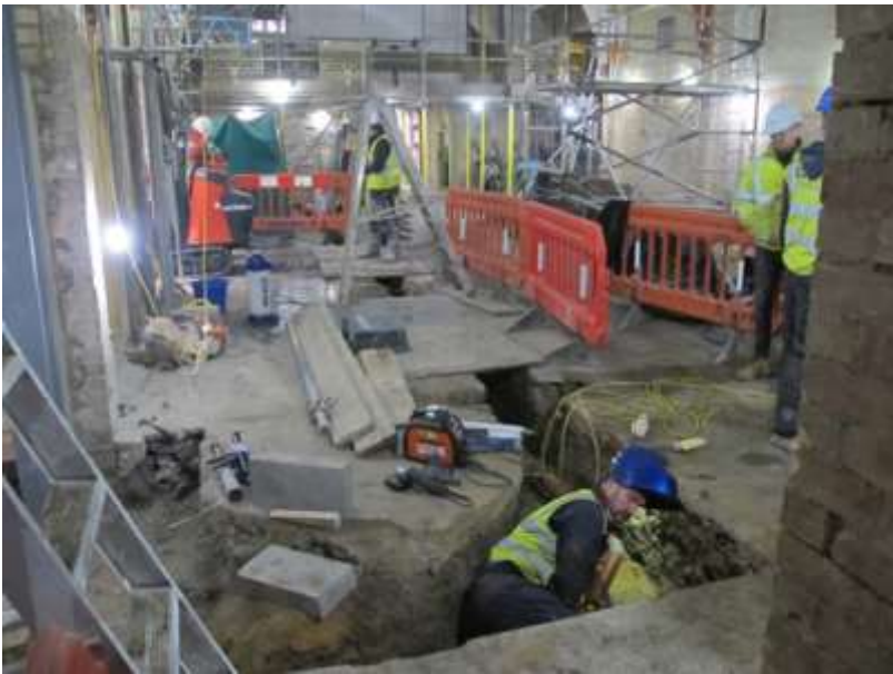
St Columba's Hall - The New Hub (2)