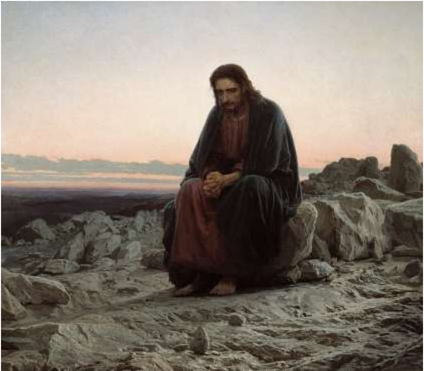
‘Christ in the Wilderness’ - oil on canvas by Ivan Kromskoi