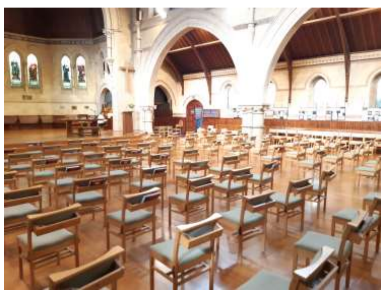
Emmanuel Church, with chairs spaced out for our service and Church Meeting on Sunday 15th March"